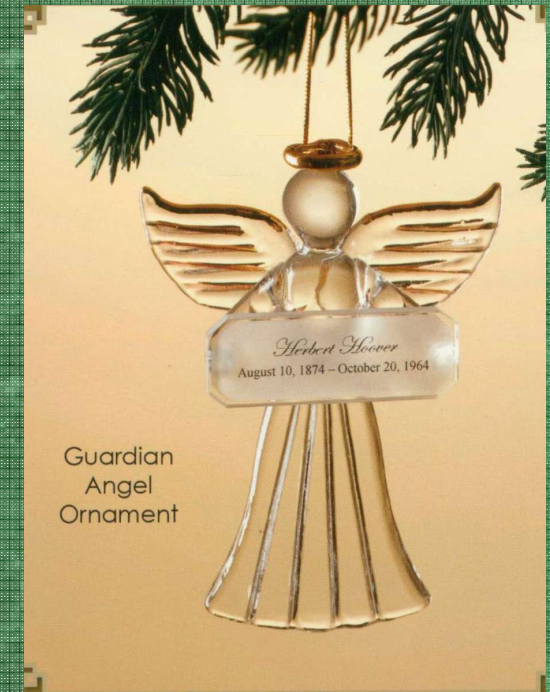
Guardian Angel Ornament