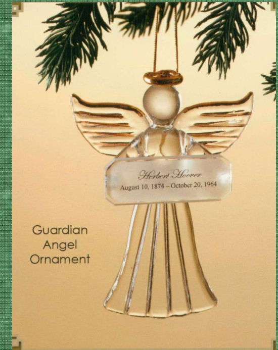
Guardian Angel Ornament

Funding for this brochure has been provided by the North West Local Health Integration Network (LHIN). Hospice Northwest is also funded by the United Way of Thunder Bay and by the generous support of our donors. Mac’s Convenience Store, located at 3 Balsam Street in Thunder Bay, supports Hospice Northwest through the sale of Nevada tickets. Bayshore Home Health generously supports Hospice Northwest through third party fundraising initiatives such as the annual Butterfly Boogie, held each May. Charitable Registration No: 11887-1011-RR0001