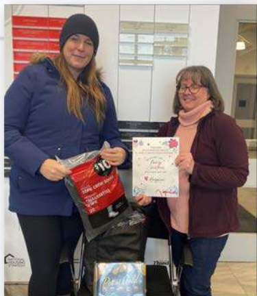
PRESENTING SOCKS TO SALVATION ARMY

Multilingual Volunteers: We are able to offer services to clients in the following 12 languages: English, French, Finnish, Oji-Cree, Portuguese, German, Dutch, Turkish, Spanish, Italian, Hindi and Mandarin