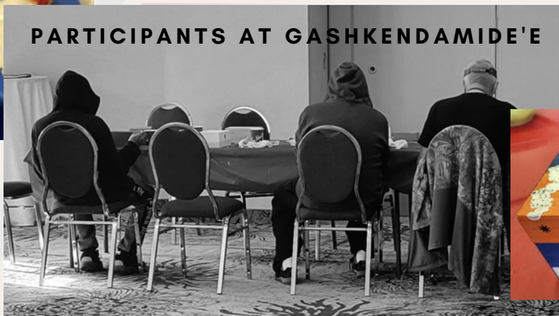
PARTICIPANTS AT GASHKENDAMIDE'E