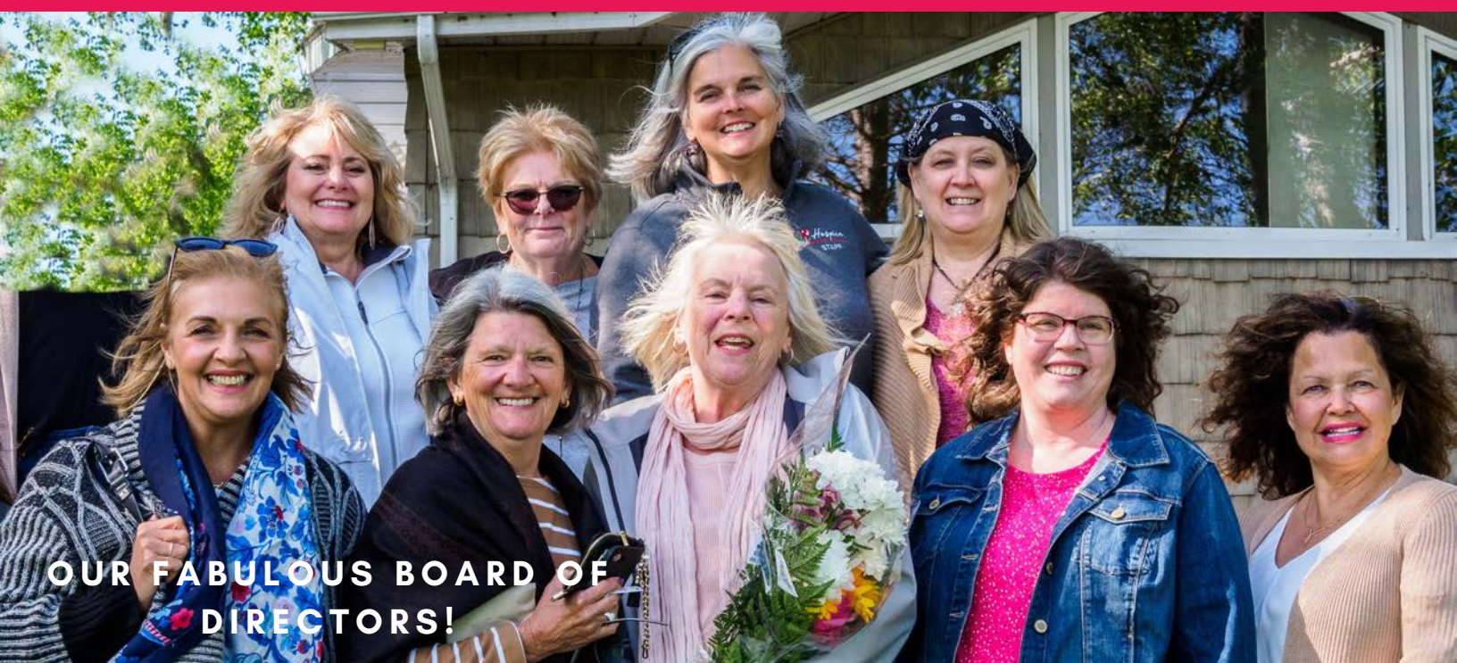
OUR FABULOUS BOARD OF DIRECTORS!